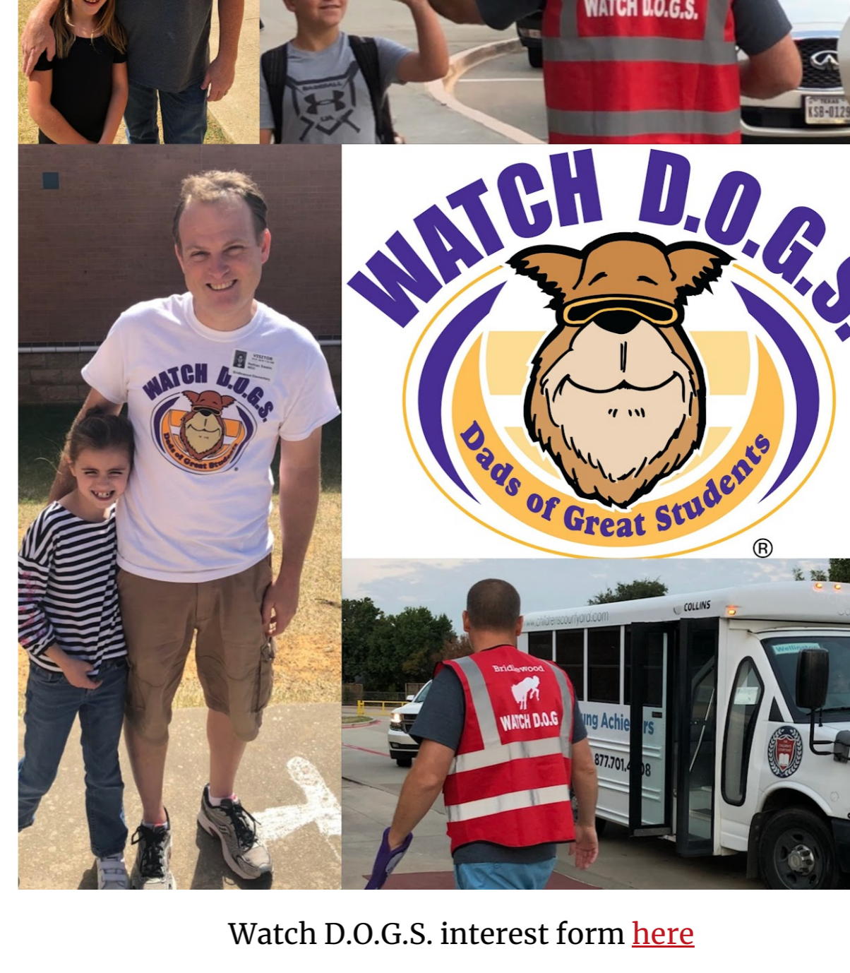
Watch D.O.G.S. interest form here